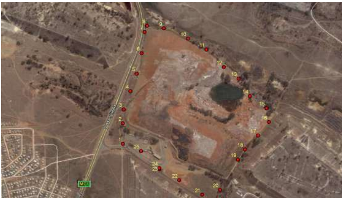
Figure 5: Locations of subsurface probes and boreholes currently at Marie Louise landfill site.

Marie Louise is located along Elias Motsoaledi Road, Dobsonville, Soweto. The landfill covers 44 hectares and surrounding land is mainly used for industrial, residential and mining purposes. The eastern and southern slopes of the closed cells have a final cap although most of the surface is covered with a temporary thin layer of soil (mostly builders' rubble). Currently there are 30 subsurface probes on the site.