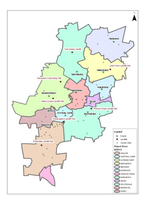
Figure 1: Pikitup area of operations

Pikitup executes its mandate to the city and its residents through 12 depots, 4 landfill sites, 42 garden sites and one composting site called Panorama based in Ruimsig.